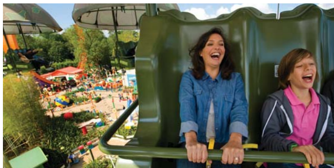
Toy Soldiers Parachute Drop